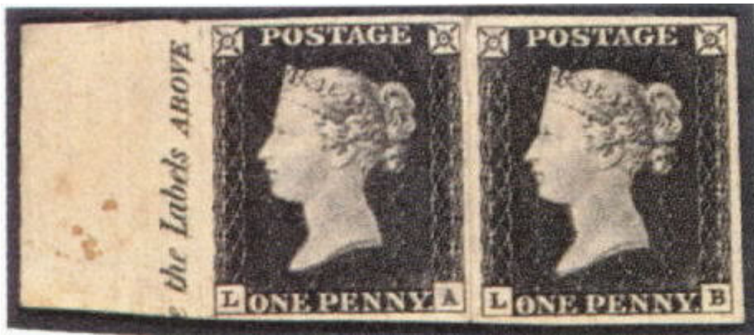
Plate 1a (continued)