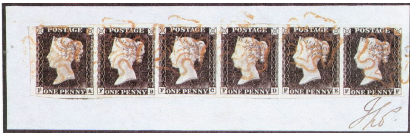
Plate 1a (continued)