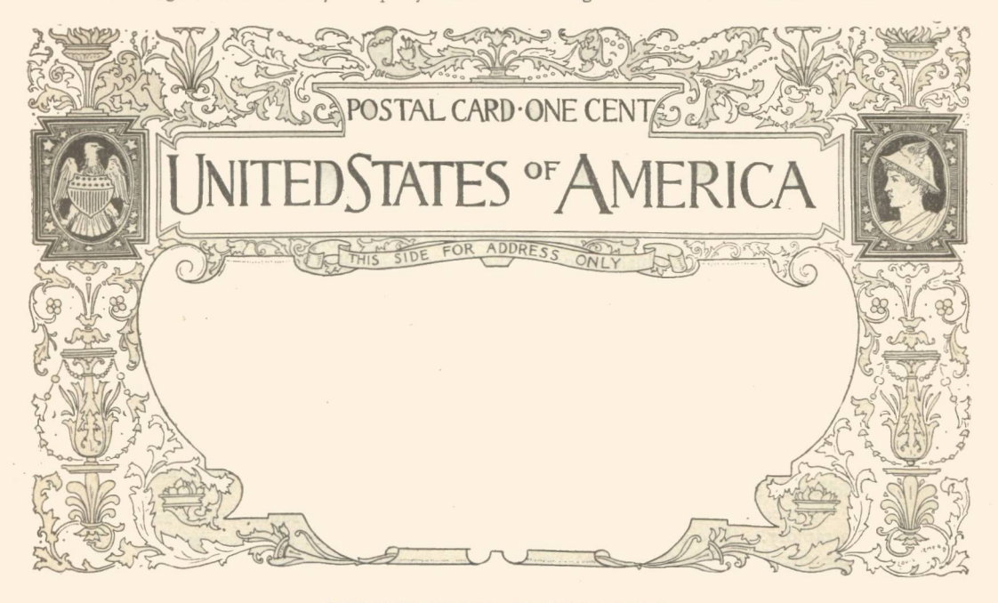
SPECIALLY DESIGNED BY LOUIS J. RHEAD.

Reaching into my pocket I drew out the envelope and postal card used in the United States, in order to compare the designs with the fine drawing of the French five-cent stamp, which embodies a figure of Mercury clasping the hand of Liberty or Commerce, both leaning on the Globe. The drawing was about 6 x 10 inches, beautifully designed, drawn, and a fit stamp for all time, whatever administration may be in power. the design reached far beyond party limits and is higher in its ethical intention than